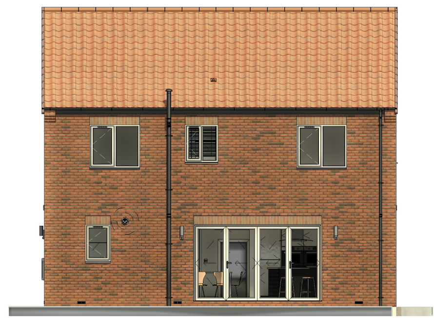
Rear Elevation. 1 : 100