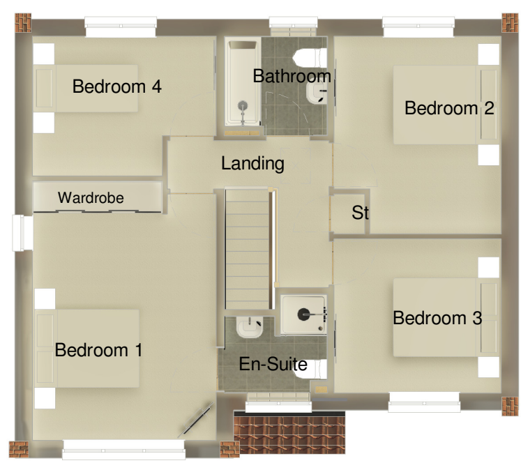
First Floor. 1 : 100