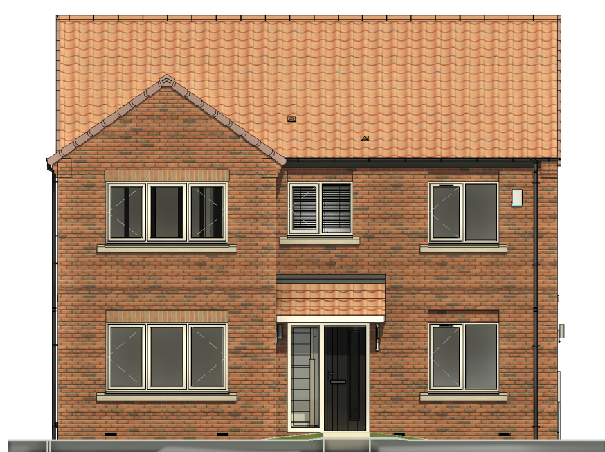
Front Elevation. 1 : 100