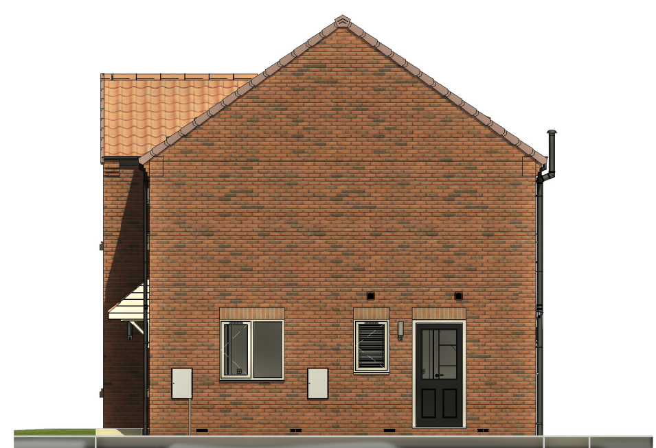
Left Elevation. 1 : 100