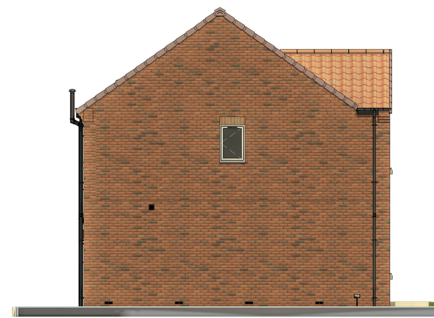
Right Elevation. 1 : 100